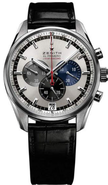
Limited edition Zenith El Primero Striking 10th chronograph