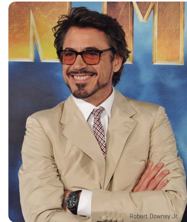
Robert Downey Jr.