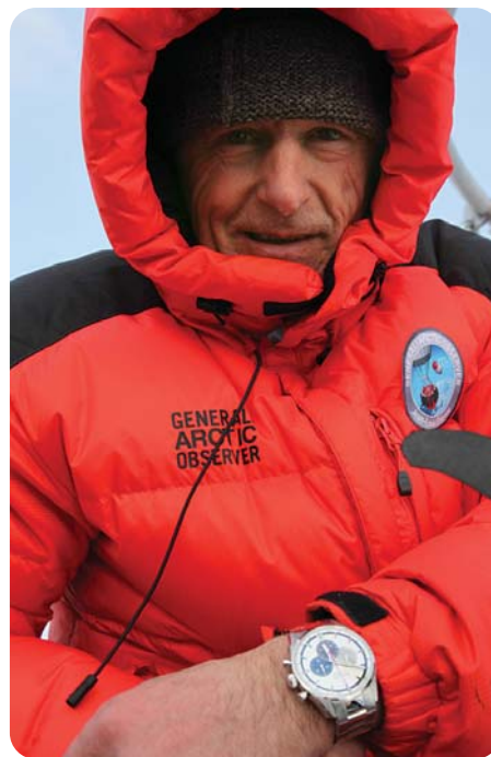
Dr. Jean-Louis Etienne

Eighty-four years after Roald Amundsen reached the North Pole wearing a Zenith watch, Zenith was part of an expedition that revisited the planet's most northerly point when French physician and polar explorer Dr. Jean-Louis Etienne became the first person to fly solo across the North Pole alone in a balloon, and, on this venture, aimed at collecting environmental data, Etienne wore No. 001 in the limited edition Zenith El Primero Striking 10th chronograph. Climate researchers today lack scientific data from the North Pole, one of the areas most sensitive to climate change. The sea ice will not support a permanent scientific station at the North Pole, but Etienne's environmentally clean form of transport provides sufficient flight time for gathering reliable data on the amount of CO2 entering the Arctic and on Earth's magnetic field. The mission was a success in spite of encountering blizzard conditions and violent turbulence. Both Etienne and the El Primero Striking 10th landed safely in Siberia five days after taking off from Norway. 866.260.0460, zenith-watches.com