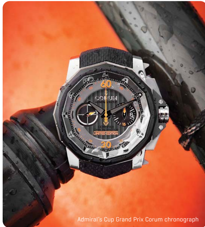
Admiral's Cup Grand Prix Corum chronograph

EVENT REPORT | WHO'S DOING WHAT, WHERE AND WHY IN THE WATCH INDUSTRY