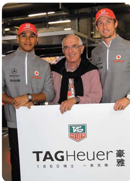
Jack Heuer with TAG Heuer ambassadors Lewis Hamilton and Jenson Button

Five decades after taking to the pits and paddocks of the Twelve Hours of Sebring Race as timekeeper, where he was inspired to create the Carrera collection, TAG Heuer honorary chairman Jack Heuer returned to his racing roots on April 18 at the Shanghai Grand Prix, where he watched TAG Heuer ambassadors Jenson Button and Lewis Hamilton take first and second place, respectively. Heuer spent the day inside the McLaren pit, wearing a headset linked to engineers and technicians. "My best race ever," says Heuer, commenting on the experience. "It sent me back decades, and I could feel my beginner's spirit during the whole weekend." The 78-year-old adds, "I was like a kid in a chocolate factory! I have lived Formula 1 backstage for several years, but this world has evolved so fast. This was like a totally new experience." 866.260.0460, tagheuer.com