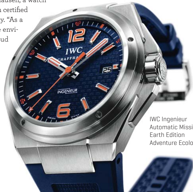
IWC Ingenieur Automatic Mission Earth Edition Adventure Ecology