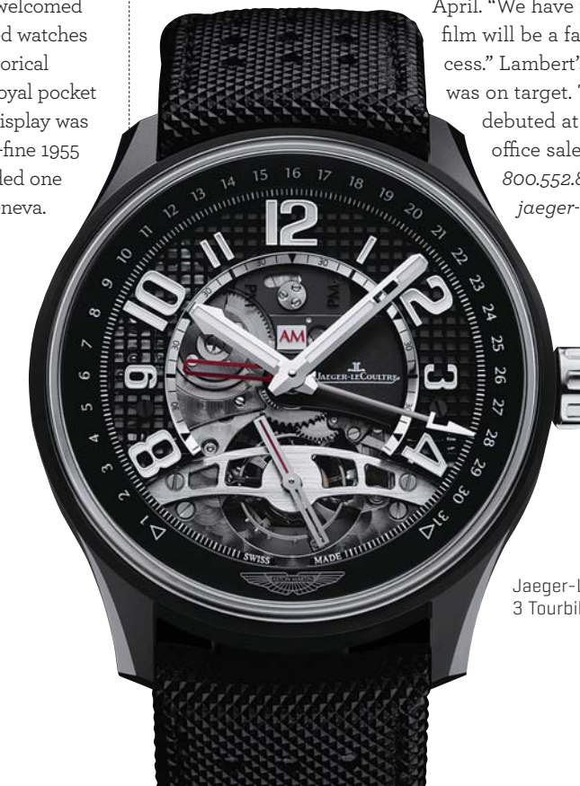
Jaeger-LeCoultre AMVOX 3 Tourbillon Platinum