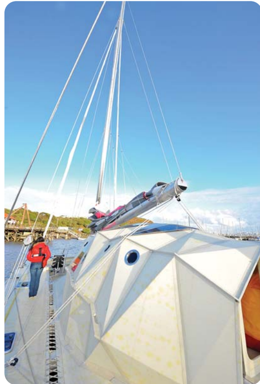
The Plastiki just before launching from San Francisco in March

EVENT REPORT | WHO'S DOING WHAT, WHERE AND WHY IN THE WATCH INDUSTRY