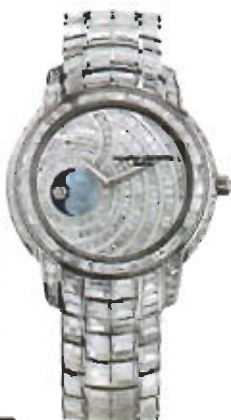
Vacheron Constantin Kalla Lune watch with 134 baguette-cut diamonds in the case, 170 baguette-cut diamonds and 9 brilliant-cut diamonds on the bracelet, price upon request, 877-862-7555, vacheron-constantin.com