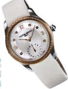
Frédérique Constant stainless steel gold-top ring with diamonds, $4950, Westime, Beverly Hills, 310-271-0000 frederique-constant.com