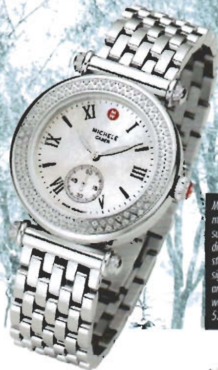
Michele Caber natural mother-of-pearl dial surrounded by 140 diamonds with stainless steel case and bracelet, signature MW crown and Swiss movement watch, $1545, 800-522-TIME, michele.com