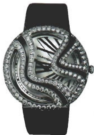
Cartier Libre collection Ronde fantaisiste watch, case in 18K rhodiumized white gold set with round diamonds, $67,500, Cartier, Beverly Hills, 310-275-4272, cartier.com