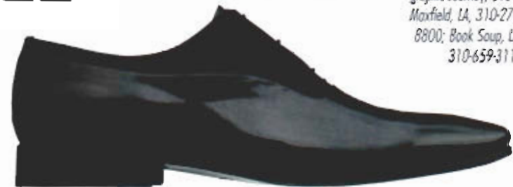
Dior Homme black tuxedo shoe with grosgrain trim, $780, Dior Homme, Beverly Hills, 310-247-8003