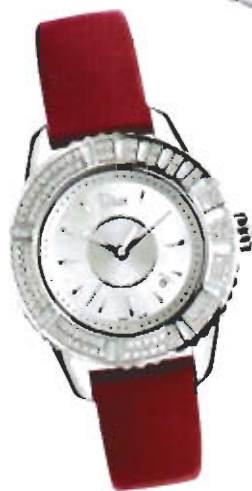
Dior Christal 33mm ETA Swiss quartz watch, stainless steel case, red patent calf leather strap, bezel set with diamonds and white sapphire crystal inserts with white mother-of-pearl dial, $5050, Dior Boutique, Beverly Hills, 310-859-4700