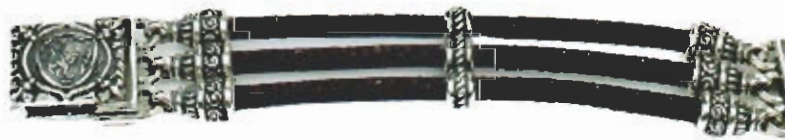
Lord Griffon Stingray Bracelet, $820, Premier Men, LA, 310-854-0600