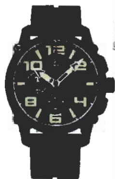
Porsche Design P'6930 Chronograph, $10,800, Porsche Design Store, 310-205-0095