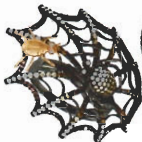
Le Vian 18K Blackberry Gold™ spider and web ring with white and natural fancy-colored diamonds including Chocolate Diamonds® with 18K Strawberry Gold™ insect, $7698, Bloomingdale's, Westfield Century City, 310-772-2100; levia.com