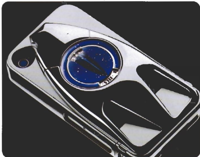
De Bethune Dream Watch IV for the iPhone 4S