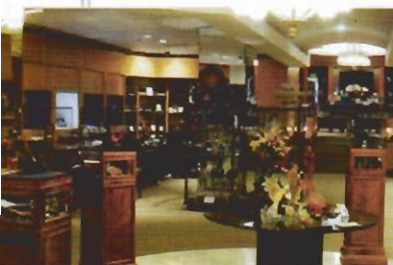
David Orgell interior, Beverly Hills

WESTIME .....310.470.1388 10800 W. Pico Blvd., Suite 197 Los Angeles (also Beverly Hills)