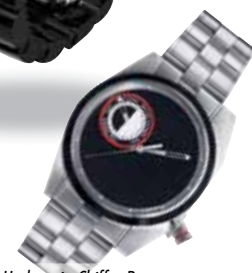
Dior Horlogerie Chiffre Rouge T01 42mm automatic watch, limited edition of 100 pieces, $8500, Dior Homme Boutique, Beverly Hills, 310-247-8003