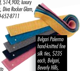
Bulgari Palermo hand-knitted fine silk ties, $235 each, Bvlgari, Beverly Hills, 310-858-9216