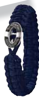
Soldier to Soldier handcrafted parachute cord and sterling silver bracelet, $95, fromsoldiertosoldier.org. $25 from each sale goes to Homes for Our Troops, homesforourtroops.org