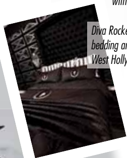
Diva Rocker Glam bed, $14,900; luxury bedding and faux furs, Diva Rocker Glam, West Hollywood, 310-652-8711