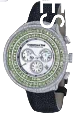
Christian Tsé 48mm watch featuring zultanite and diamonds on an alligator band, $30,000, Neiman Marcus, Beverly Hills, 310-550-5900; christiantse.com