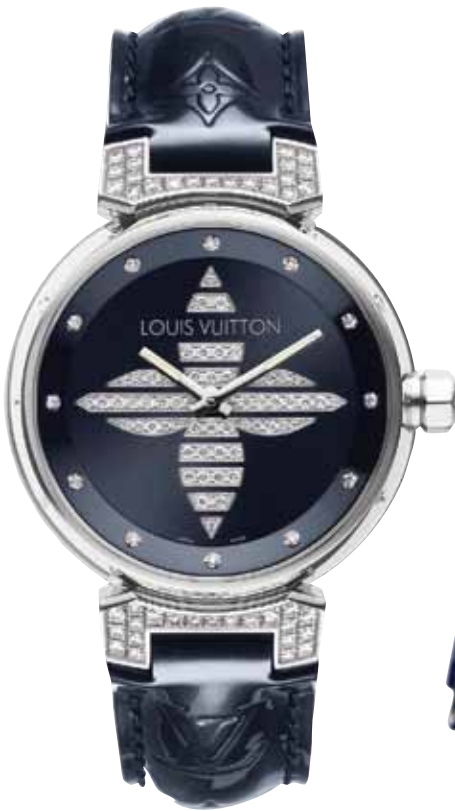
Louis Vuitton Tambour Forever Blue Infini watch, $10,500, Louis Vuitton, Beverly Hills, 310-859-0457