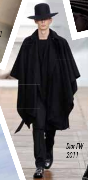
Dior FW 2011