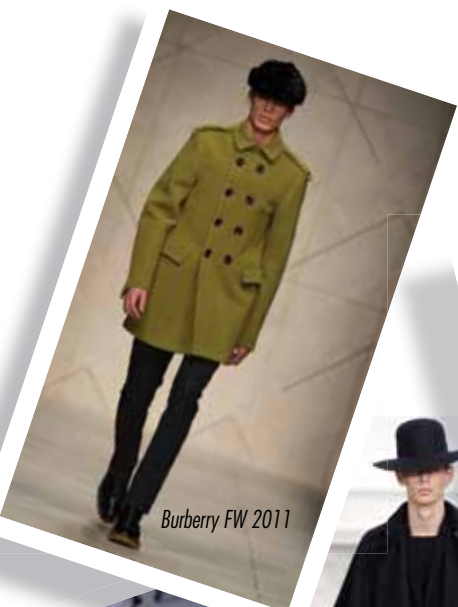
Burberry FW 2011