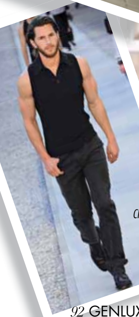
CHANEL Resort 2012