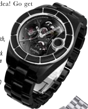
CHANEL J12 Retrograde Mysteriuse watch, $300,000, only ten in black made, exclusive to Westime, Beverly Hills, 310-271-0000