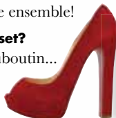
Christian Louboutin Bambou pump, $795, Christian Louboutin, South Coast Plaza, 714-754-9200

I'm a shoe fanatic! I love Christian Louboutin... I also really like the brand Vince.