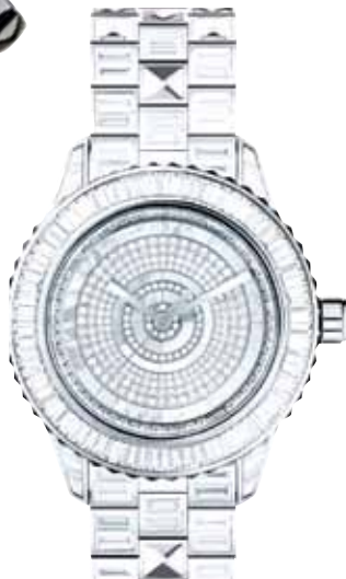
Dior Christal 38mm Automatic watch with a white mother of pearl dial set with diamonds, bezel set with diamonds, bracelet set with diamonds and light grey sapphire crystals, $276,000, Dior, Beverly Hills, 310-859-4700