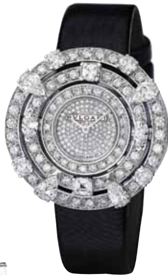
Bvlgari High Jewelry Concentrica 18K white gold with diamonds watch on a satin strap, price upon request, Bvlgari, Beverly Hills, 310-858-9216, bvlgari.com