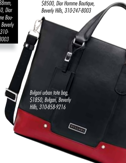
Bvlgari urban tote bag, $1850, Bvlgari, Beverly Hills, 310-858-9216