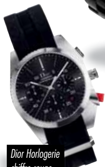
Dior Horlogerie chiffre rouge A02 38mm, $4350, Dior Homme Boutique, Beverly Hills, 310-247-8003