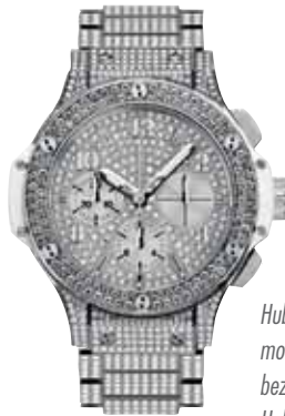
Hublot Big Bang St. Moritz chronograph movement watch, steel bracelet, case and bezel set with circular diamonds, $79,900, Hublot, Beverly Hills, 310-550-0595