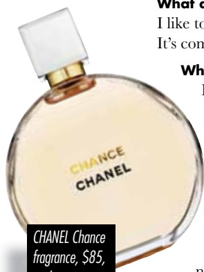
CHANEL Chance fragrance, $85, sephora.com