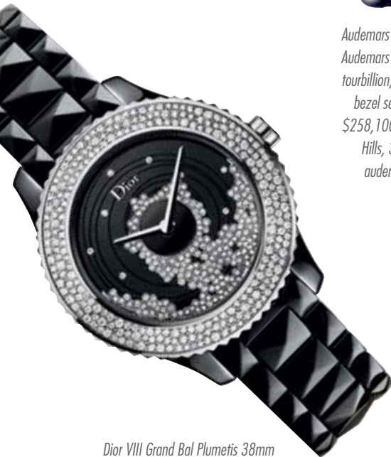
Dior VIII Grand Bal Plumetis 38mm Automatic watch with "Dior Inverse" calibre, snow-set bezel, black mother of pearl from Vietnam dial set with diamonds, transparent sapphire crystal case-back, black high-tech ceramic and steel case, black ceramic pyramid-shaped bracelet, $36,500, Dior, Beverly Hills, 310-859-4700