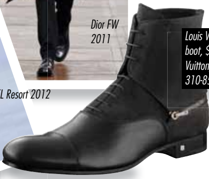
Louis Vuitton Atlas boot, $1090, Louis Vuitton, Beverly Hills, 310-859-0457