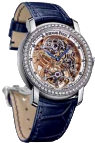
Audemars Piguet Ladies' Jules Audemars watch, hand-wound tourbillon, platinum case with bezel set with diamonds, $258,100, Westime, Beverly Hills, 310-271-0000; audemarspiguet.com