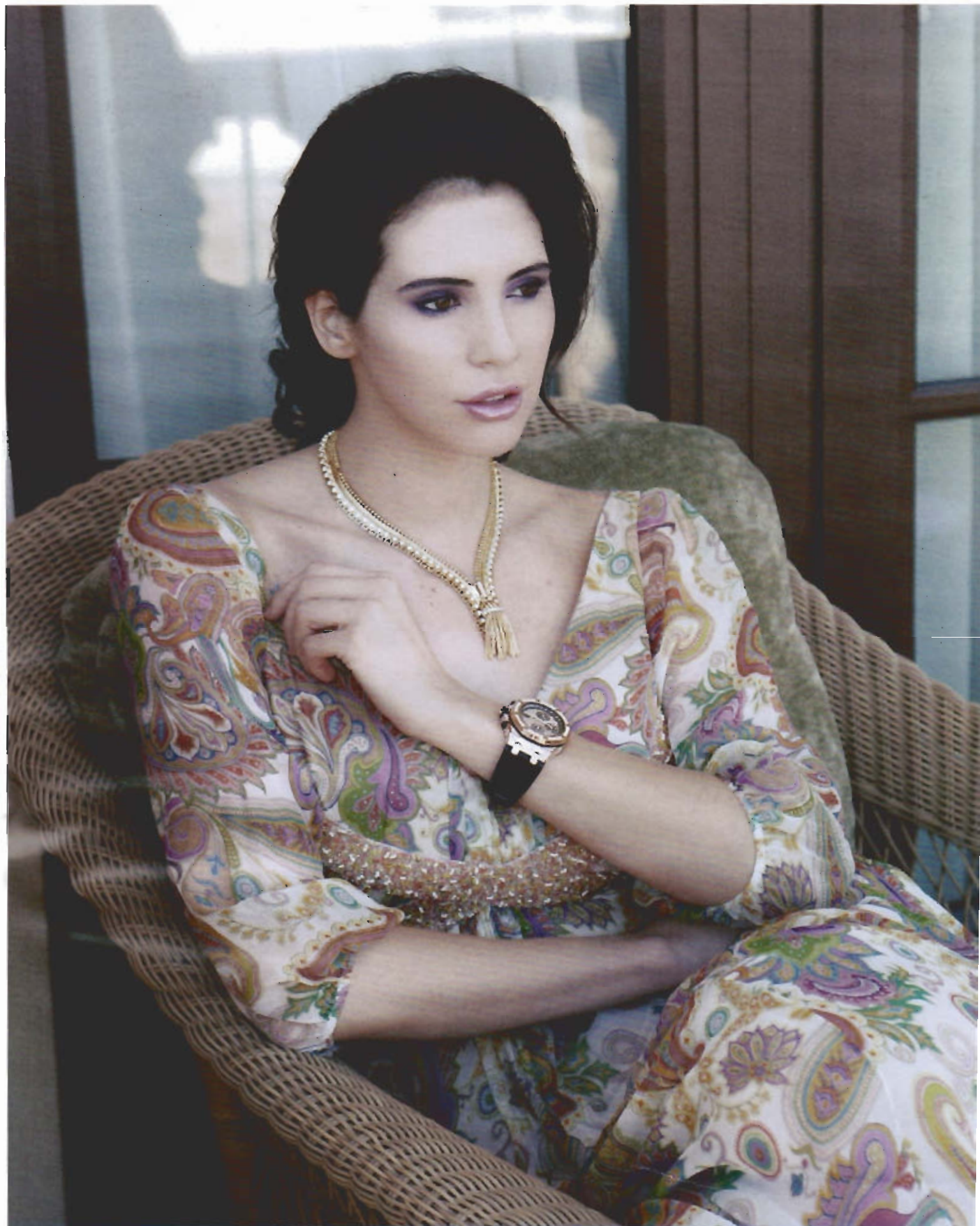
KEVAN HALL PAISLEY SILK CHIFFON GOWN, $3,500, AVAILABLE AT KEVANHALLDESIGNS.COM VAN CLEEF & ARPELS ZIP ANTIQUE NECKLACE FEATURING DIAMONDS SET IN 18K YELLOW GOLD AND PLATINUM. PRICE UPON REQUEST, AT VAN CLEEF & ARPELS BOUTIQUES AUDEMARS PIGUET ROYAL OAK OFFSHORE IN YELLOW GOLD WITH FULL SET DIAMOND CASE, $103,400, AVAILABLE AT WESTIME, BEVERLY HILLS